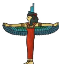
Isis Mother Goddess, Goddess of Protection and Healing