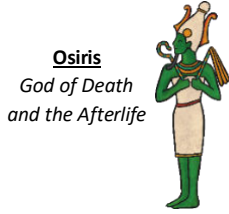
Osiris God of Death and the Afterlife