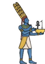
Amun King of the Gods

The Valley of the Kings (where most Pharaohs were buried) was near Luxor, close to Thebes.