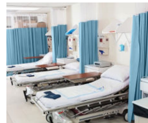
Today (modern day= present)

Florence worked to make the hospitals safer and cleaner. They got beds, clean bandages, and food.